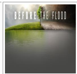
Before the Flood