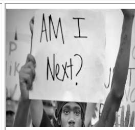
Marginalized in America (Discussion, Special Location)