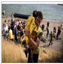
Syrian Refugees in Modesto